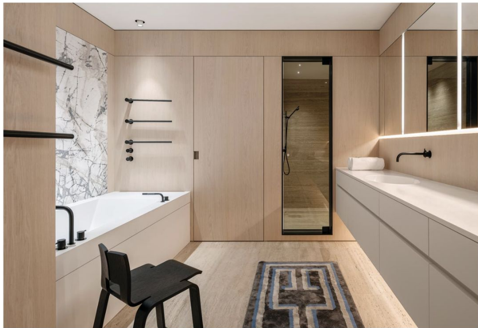
The primary bathroom defies convention by integrating warm wood tones, a design choice imbuing the room with an inviting, serene atmosphere. A bookmatched stone wall frames a Domovari tub, generating a stunning centerpiece. Black Vola fixtures and Charlotte Perriand's Ombra Tokyo chair from Cassina emanate minimalist luxury, while a vibrant rug by Vincent Darré adds a bold touch of character.

It's hardly a secret why the global elite are drawn to Fisher Island. A world of its own just three miles from the tip of Miami Beach, the private island offers the type of one-percent pleasures few get to experience. In terms of real estate, the enclave's extravagant villas and condominiums reflect the intricate Moorish architectural influences inspired by the original 1920s homes once built there by William Kissam Vanderbilt II, the bon vivant who traded his 265-foot yacht for seven acres of the island back in 1927. It was the sum of all this that prompted a Chicago couple to choose the serene locale as an interlude home for their fast-paced lives.