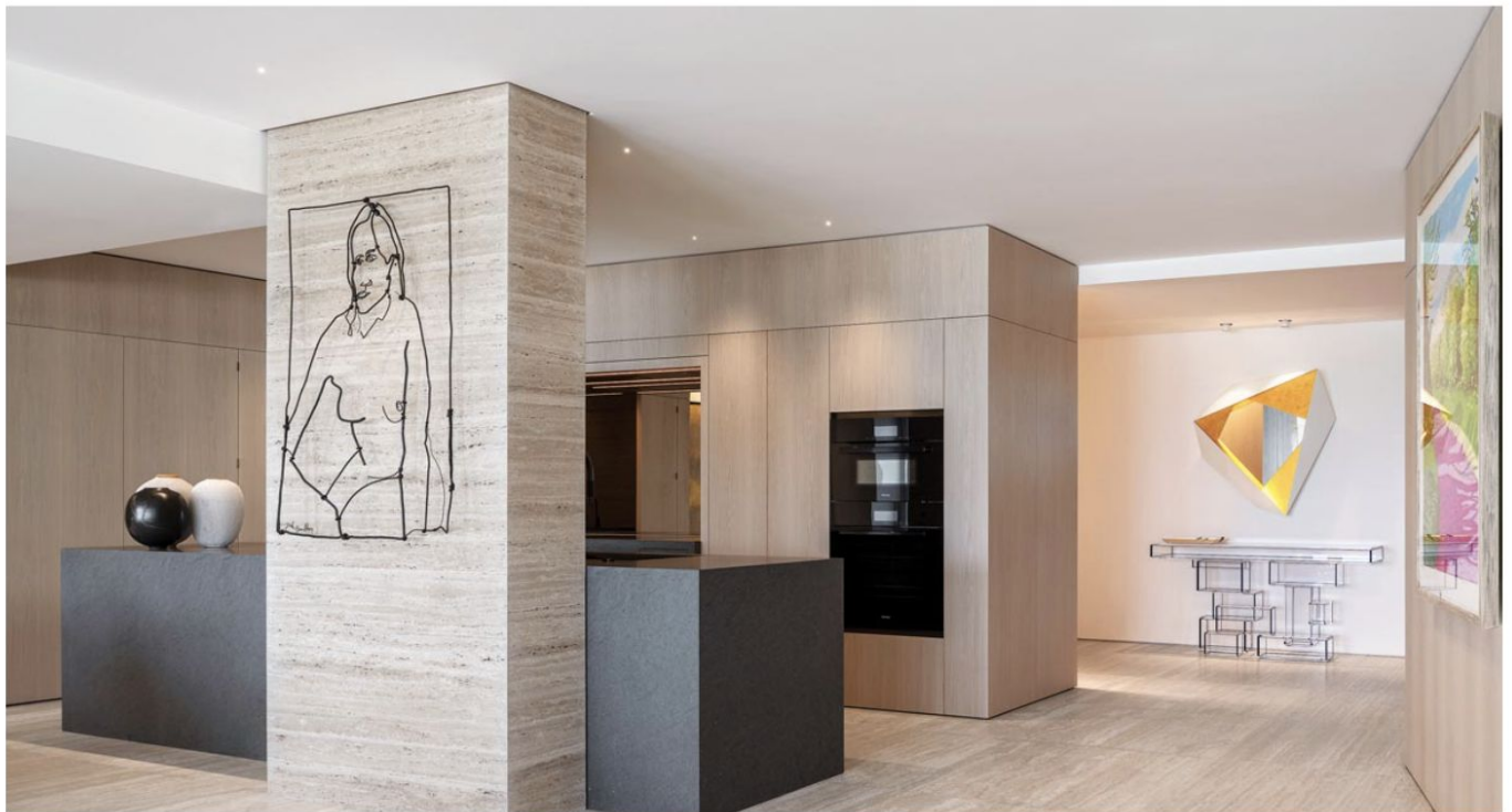
The kitchen design balances functionality and understated elegance with a base unit finished in Forbo linoleum topped with a sleek basaltina surface. Artwork elevates the aesthetic with Julie Gauthron's wrought-iron La Muse Solaire and Hervé Van der Straeten's angular yellow wall hanging and transparent console table.