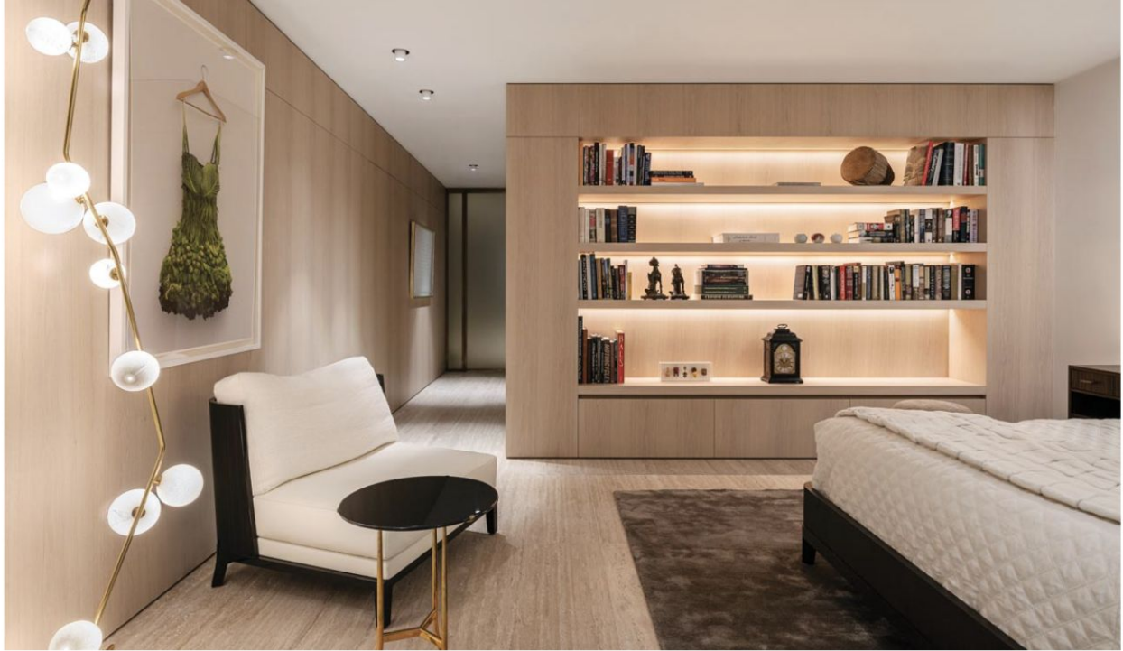
The primary bedroom showcases illuminated custom cabinetry crafted by the carpenters at Holzrausch in Germany. Photographer Sarah Illenberger's Vegetable Dress adds a playful artistic touch, while below it, an Aspre lounge chair by Liaigre pairs seamlessly with Lindsey Adelman's Cherry Bomb floor light.