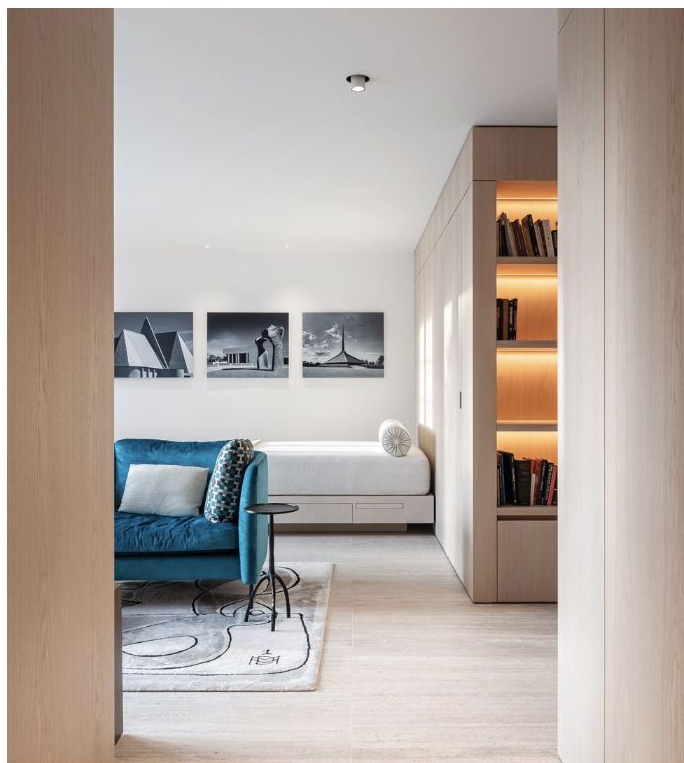
The guest room's illuminated bookshelf creates a luminous focal point accented by a daybed designed by architect Dirk Lohan, the grandson of Mies van der Rohe. A teal sofa from Boffi|DePadova creates a vibrant contrast against a side table from Liaigre, a Vincent Darré area rug, and Balthazar Korab's black-and-white photographs.