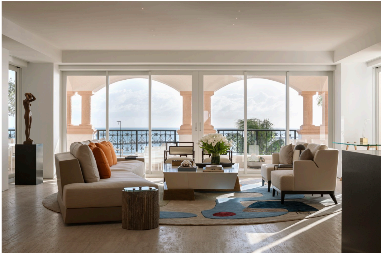
Floor-to-ceiling glass frames views of the ocean.

Yet, for all its refinement, the residence never loses its connection to place. Expansive, nearly frameless glass doors open wide to a sun-drenched terrace overlooking the Atlantic. Arched columns and wrought-iron railings echo the historic Moorish architecture of the island, while modern interventions soften the transition between indoors and out.