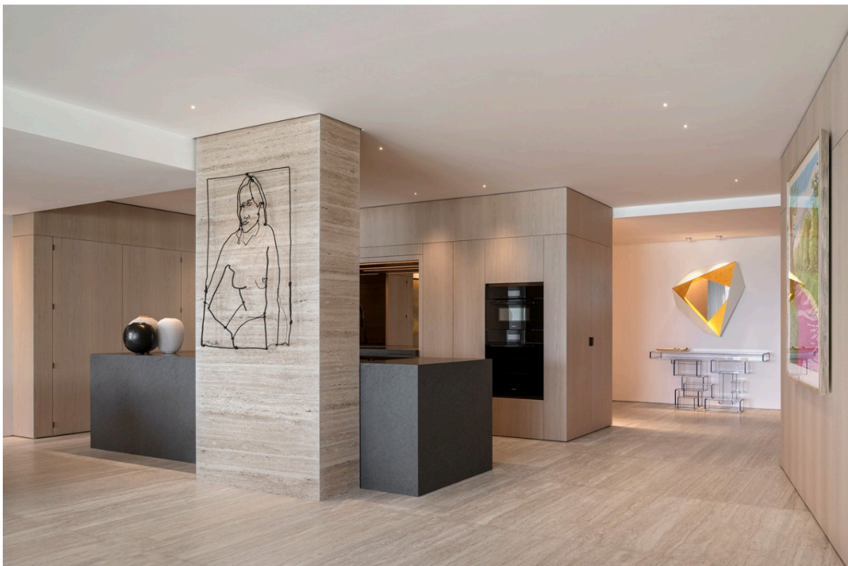
A wireframe sculpture mounted on travertine sets a serene tone in the softly sculpted kitchen.

Located on one of Florida's most exclusive islands, this 2,400-square-foot home offers a deeply considered blend of function and tranquillity. Designed by Holzrausch—one of Europe's most revered studios known for its exceptional woodwork and spatial precision—the space reflects a seamless dialogue between architectural clarity and the relaxed cadence of coastal life.