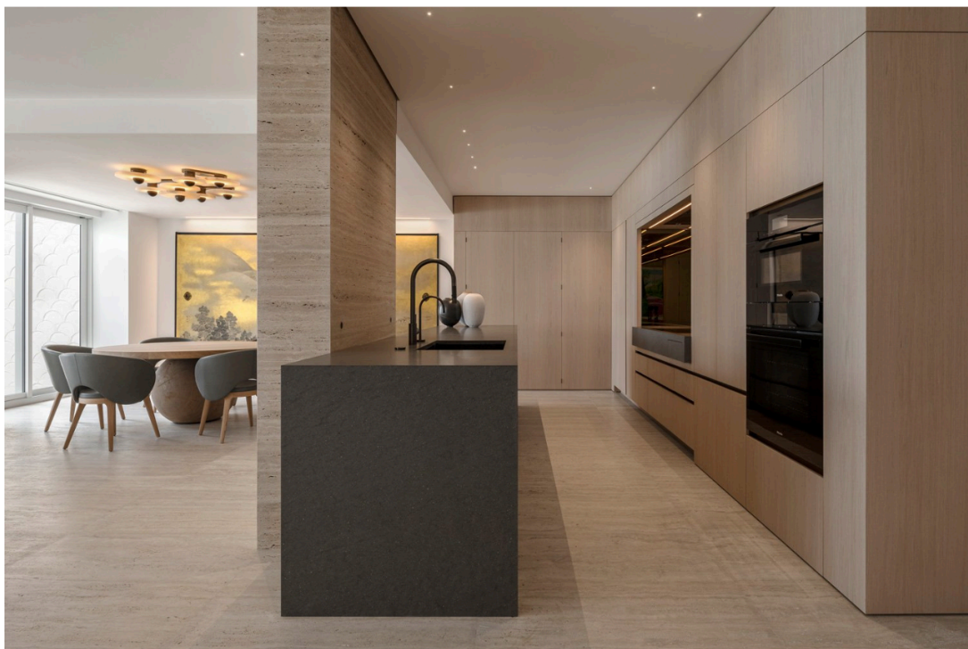
Sophisticated materials and strong forms defines the open-plan living area.

The material palette is calm, yet layered. Roman travertine flows underfoot, meeting walls of whitewashed European oak that stretch across the interiors like warm ribbons of light. The architecture is enhanced by custom cabinetry, designed and fabricated in Germany, then assembled onsite by master carpenters—evidence of Holzrausch’s dedication to craftsmanship at every turn.